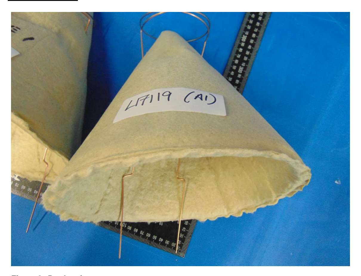
Figure 3. Product image